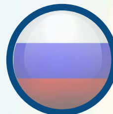
RUSSIA (WR: 4)