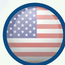
USA (WR: 1)