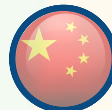
CHINA (WR: 2)