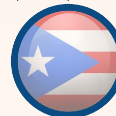
PUERTO RICO (WR: 16)