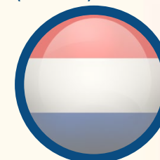
NETHERLANDS (WR: 14)