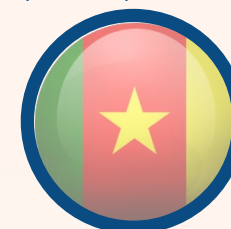
CAMEROON (WR: 21)