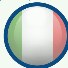
ITALY (WR: 8)