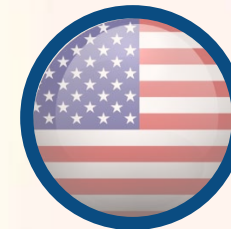
USA (WR: 5)