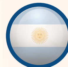
ARGENTINA (WR: 6)