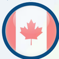
CANADA (WR: 10)