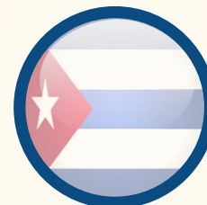
CUBA (WR: 15)