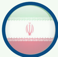
IRAN (WR: 8)