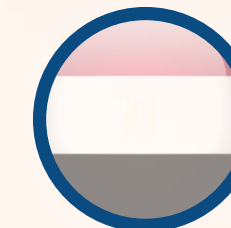
EGYPT (WR: 17)