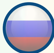
RUSSIA (WR: 3)