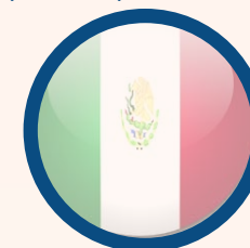
MEXICO (WR: 24)