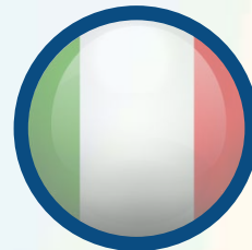
ITALY (WR: 4)