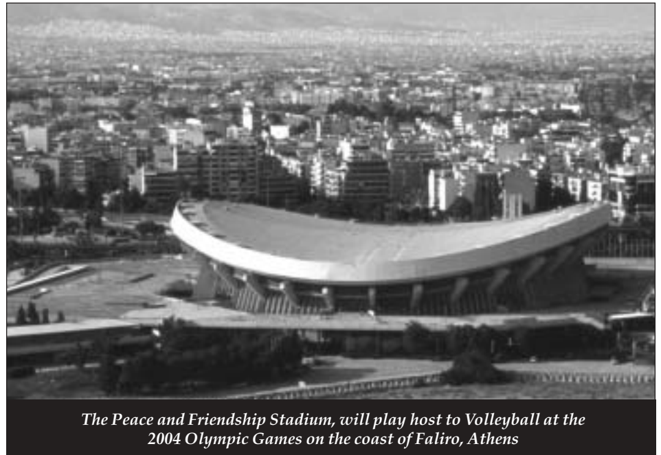
The Peace and Friendship Stadium, will play host to Volleyball at the 2004 Olympic Games on the coast of Faliro, Athens