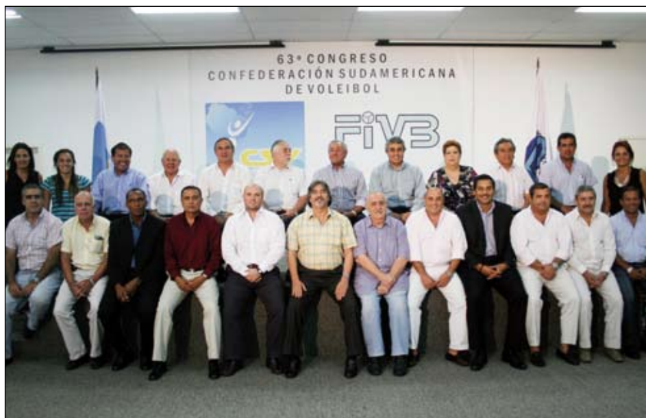
The CSV launched two new competitions at its annual Congress as well as a number of new training projects

During the meeting, held at the Volleyball Development Center of the Brazilian Volleyball Confederation, known as "Aryzão", a number of issues concerning the structure and strength of South American Volleyball, including initiatives to prove that the continent continues to remain competitive on the world stage, were raised. As a result, CSV decided they will work with a number of national federations to help provide them with training projects in both Volleyball and Beach Volleyball, with coaches financed by the confederation aiming to find new talents as well as run courses for local coaches.