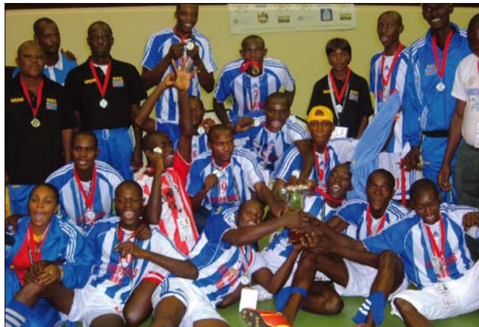
DR Congo were originally viewed as underdogs for the African Youth Olympic Games Qualifier

The central African country, who also beat Morocco and South Africa in the tournament, will now represent the continent at the Games due to take place in Singapore from August 14-26. Meanwhile, hosts South Africa beat Morocco 3-2 (25-18, 19-25, 25-20, 27-29, 15-13) in the final match of the tournament.