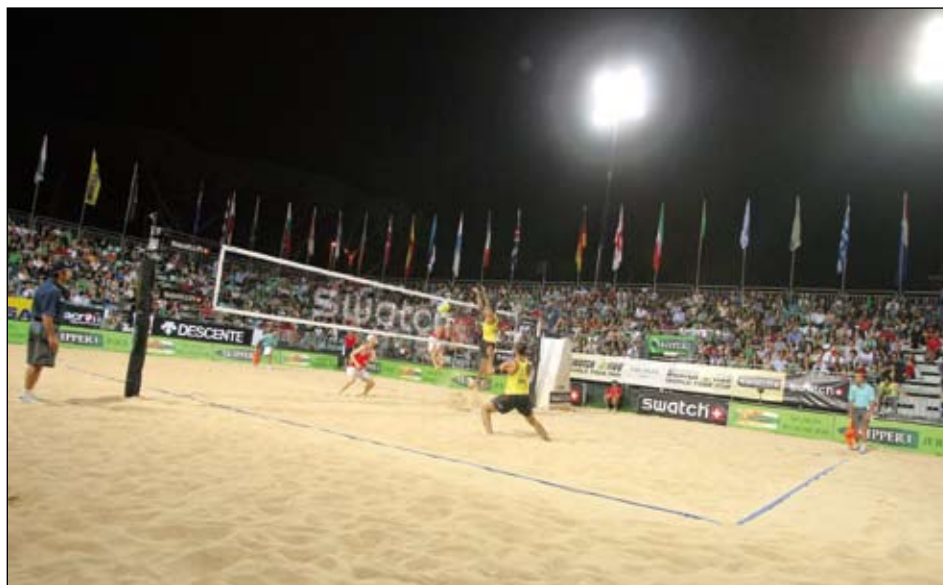
Rome hosted a men's Open tournament on last year's SWATCH FIVB World Tour

Rome, which will also be the venue for the 2011 SWATCH FIVB World Championships, hosted its first ever SWATCH FIVB World Tour event last year, with men's teams from around the world battling in the historic capital. On that occasion, eventual World Tour winners and world champions Julius Brink and Jonas Reckermann of Germany came out on top. However, this year the city will be the backdrop for one of the six Grand Slams on the 2010 SWATCH FIVB World Tour, with other hosts including Moscow in Russia, Stavanger in Norway, Gstaad in Switzerland, Klagenfurt in Austria and Stare Jablonki in Poland.