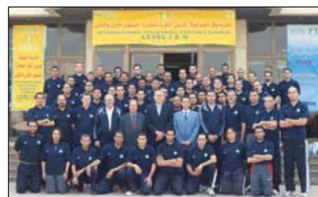
Successful development courses were completed in Dominican Republic (left), Djibouti (center) and Egypt (right) this month.