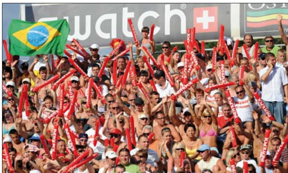
The new initiative will see Beach Volleyball fans and amateur Beach Volleyball players playing in some of the famous SWATCH FIVB World Tour venues