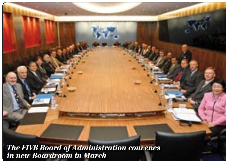
The FIVB Board of Administration convenes in new Boardroom in March

For the 2010/2011 season and on, nine local players and three players coming from other National Federations will be allowed to be registered per Club, allowing only two players coming from other