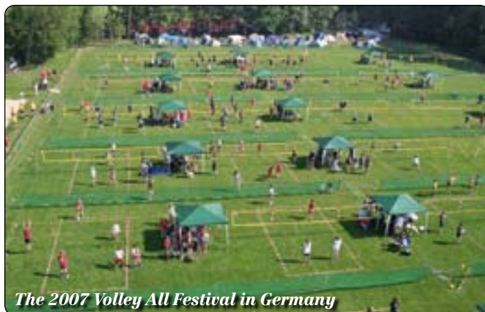
The 2007 Volley All Festival in Germany

The Volley All Festival provides an opportunity for each Federation to attract and support children and youth activities as