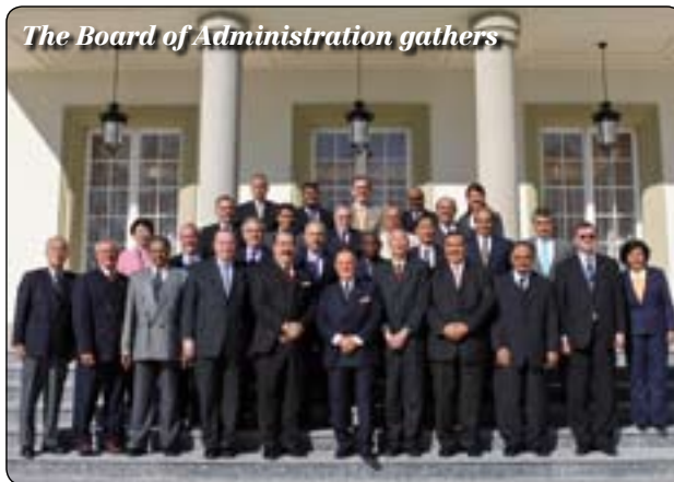
The Board of Administration gathers

During its next meeting on May 12, the FIVB Board will discuss the need to determine a limited number of ITCs per Club.