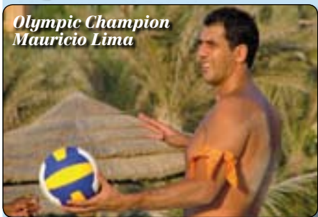
Olympic Champion Mauricio Lima