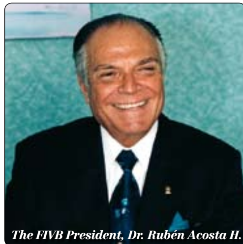
The FIVB President, Dr. Rubén Acosta H.

"We're at the beginning of a decisional process that the Board will examine next year" says the FIVB President, Dr. Rubén Acosta. "Having a strong National League in every country is part of our Vision, which is the development of young local players that we plan for all our Federations. Many different nations have started this process, but some