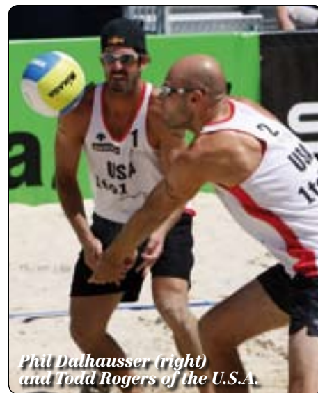
Phil Dalhausser (right) and Todd Rogers of the U.S.A.