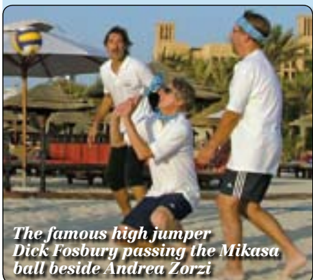
The famous high jumper Dick Fosbury passing the Mikasa ball beside Andrea Zorzi

Different teams led by former U.S.A. spiker Bob Ctvrtlik, Brazilian Volleyball star and two times Olympic champion Mauricio Lima and Andrea Zorzi fought friendly for this very peculiar medal. Pole vaulter Sergey Bubka, the high jumper Dick Fosbury (inventor of the Fosbury flop), track and field specialists Hicham El Guerrouj and Frank Fredericks, swimmer Alexander Popov and many others world top athletes used the yellow and blue Mikasa to share their talents, using Beach Volleyball skills as a common sports language.