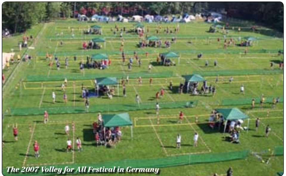
The 2007 Volley for All Festival in Germany

The FIVB Development Commission is closely following up on the mass Volleyball concept and how to organize mass Volleyball events. It is foreseen that several courses related to the mass Volleyball strategy will be organized in 2008 in various Development Centres. This year's photo is from the Volley All Festival in Germany which truly shows the spirit of how